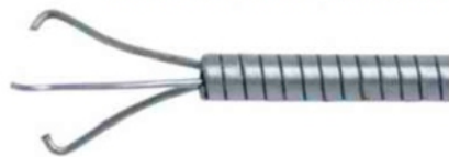
14-2104 (Ø 2X300mm) Micro grasping forceps, flexible