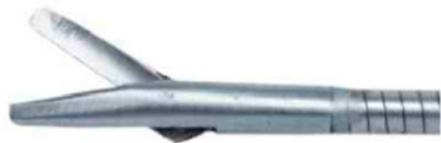
14-2102 (Ø2x300mm) Micro scissors, blunt, flexible