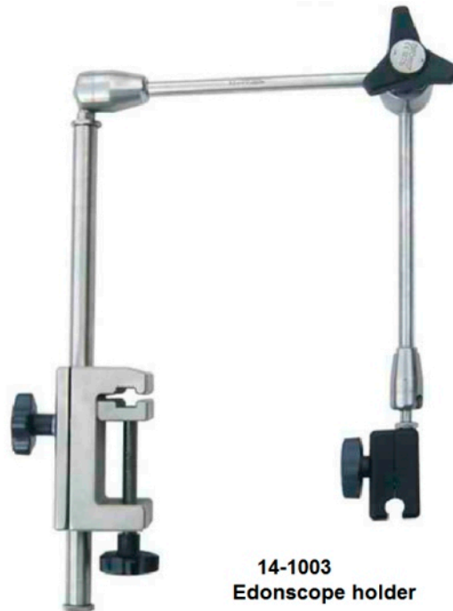
14-1003 Edonscope holder