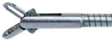
14-2103 (Ø 2X300mm) Microbiopsy forceps, flexible