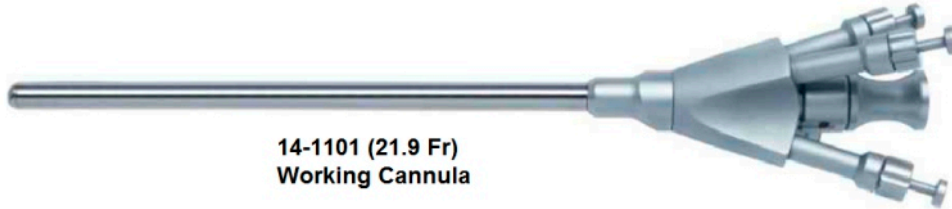
14-1101 (21.9 Fr) Working Cannula